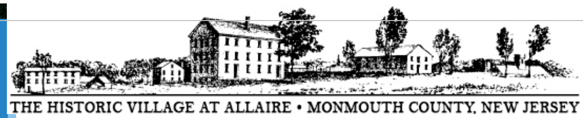
THE HISTORIC VILLAGE AT ALLAIRE • MONMOUTH COUNTY, NEW JERSEY