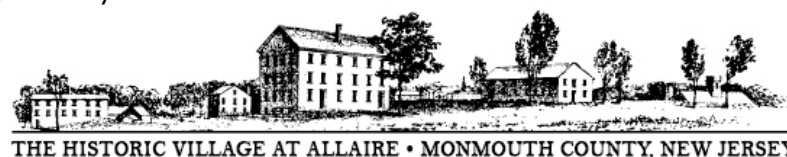
THE HISTORIC VILLAGE AT ALLAIRE • MONMOUTH COUNTY, NEW JERSEY