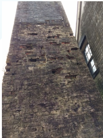
A crumbling Chimney stack attests to a hard life for this original building at the Howell Works.

The little building tucked into the hollow at the edge of the Mill Pond (and behind the Carpenter Shop) is often a mystery to all but the very frequent visitor to the Historic Village. The truth is, this building may have been present on the grounds prior to James Allaire's ownership and the real mystery is exactly what its initial purpose might have been. Like the Chapel, the Enameling Building was also built in sections and over the years, parts of the structure were added and subtracted based on the use at the time and the needs of the company. The cupola, which sits atop the structure has been on and off the roof at several times and the porch has gone through many design changes as well. In Hal Allaire's detailed account of the