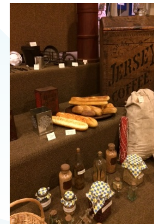
The General Store recreated circa 1836.

Other aspects of the culture that grew up around the Howell Works are also explored – occupations, clothing, education and purchasing power.