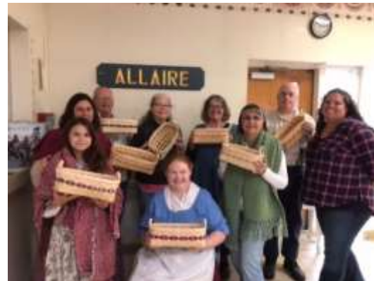
Basket Weaving Workshop