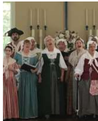
Colonial Revelers Performance