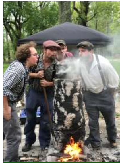
Iron Smelting Demonstration