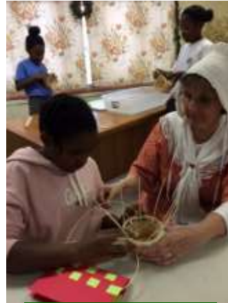
History Kids Club

We look forward to welcoming you as a Member of The Historic Village at Allaire. Your support will help keep the Village the extraordinary institution it is, and has been since 1822. Please help us in continuing our commitment to promoting a deeper understanding of our past and the men and woman who helped build the American Dream.