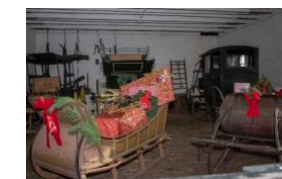
Black – Non Historical Event